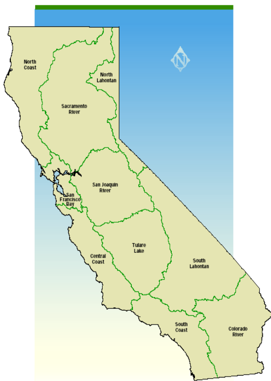
FIGURE ESI-2 California's Hydrologic Regions

The California Water Plan Update BULLETIN 104 04