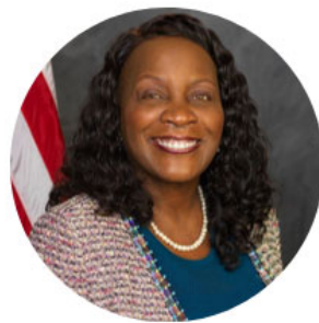
Mayor Acquanetta Warren City of Fontana